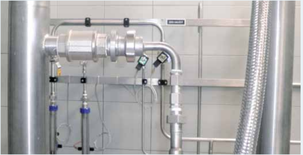
Installation of the SOLVOCARB® inline injector at the Plzeňský Prazdroj brewery.

meant that the company's traditional copper vessels were not suitable for neutralization operations. After examining the ecological, safety and process aspects of the various pH control treatment alternatives, the company decided to turn its attention to a simpler, safer, more precise and ecologically friendly alkali pH regulation agent for its new neutralization system.