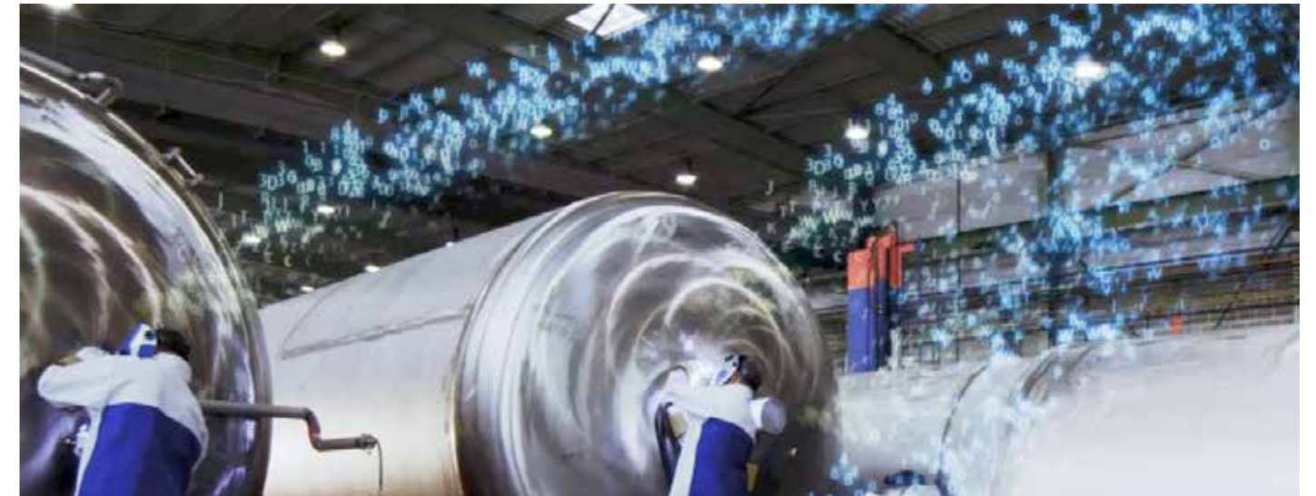
Equip your welders with the technology they need to deliver enhanced traceability and quality.