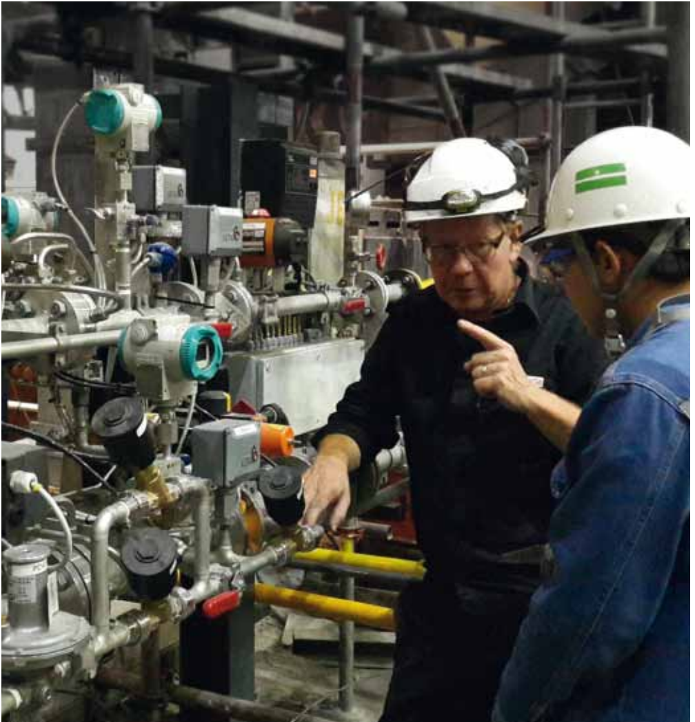
A Linde engineer explains the OXYGON® safety concept to a SYS process engineer.

channels, angles, cut beams and sheet piles. At the company's two plants in Mueang, Rayong, Thailand (SYS1 and SYS2), with melt shops and hot rolling mills, SYS fabricates approximately 1 million tonnes of steel every year.