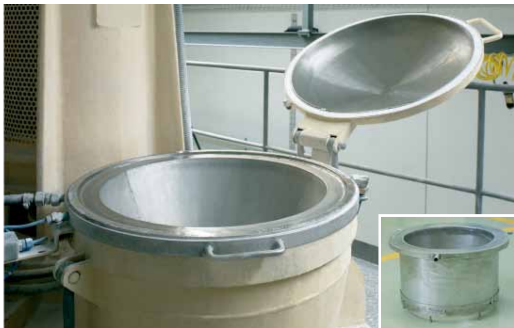
N2LOCK® system integrated in the charging hole of a mixer with a capacity of 2,000 kg.

Objective When mixers, reactors or other vessels are charged with bulk solids, air or oxygen is entrained into the vessel along with the charge. The amount of entrained oxygen should be minimised in order to provide the utmost degree of safety even in manual charging operations.