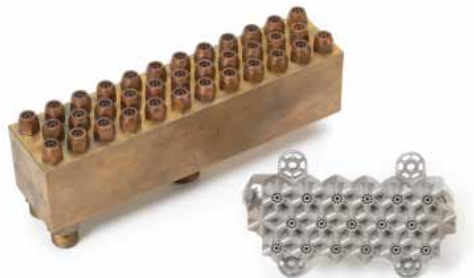
LINDOFLAMM conventionally manufactured vs. 3D printed burner

Implemented properly, AM can encourage manufacturing engineers to think beyond the boundaries of traditional manufacturing methods to reduce the number of production steps, material wastage, inventory held, and the overall parts needed to be manufactured for assembly. But an implementation framework covering both technical education and change management strategies are needed to make it work.