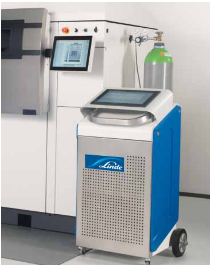
The ADDvance® O 2 precision ensures the atmosphere inside the print chamber.

Across all these AM approaches, atmospheric gases play a fundamental role in both the core printing process in addition to pre- and post-production processes such as metal powder production and storage. As is well understood and established earlier in this article, the core AM process takes place within a closed chamber filled with high-purity