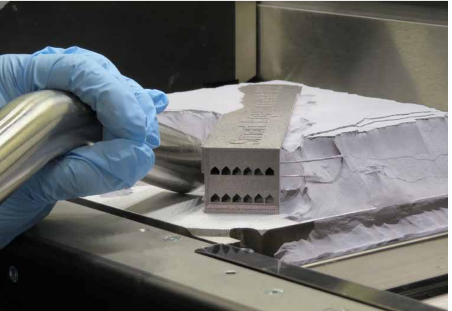
Post processing in action. With thanks to Trumpf.