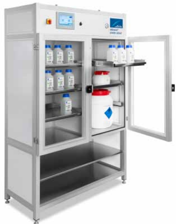
The ADDvance® powder cabinet provides the optimal storage environment for metal powders.

It is essential to maintain the correct atmosphere during storage in order to avoid humidity. Humidity will lower the flowability of the powder and will increase the amount of O 2 during printing. The latest addition to Linde's AM solutions now includes Linde's ADDvance® powder cabinet to ensure optimal conditions for powder storage.