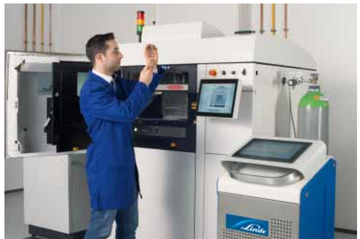
Reviewing the printed part.

Linde has developed a highly effective solution to improve cleaning. ADDvance® Cryoclean technology creates dry ice particles, or “snow”, by expanding liquid CO 2 and using compressed air to accelerate the particles up to sonic speed, shooting them onto the surface to be cleaned. The cleaning effect relies on flash cooling, kinetic energy, embrittlement and gas impact. If needed, a further abrasive agent can be added to the dry ice particles to remove more stubborn powder residue.